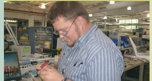
An employee of Adaptive Materials, an Alternative Energy Company in Pittsfield Township, is assembling a solid oxide fuel cell system.