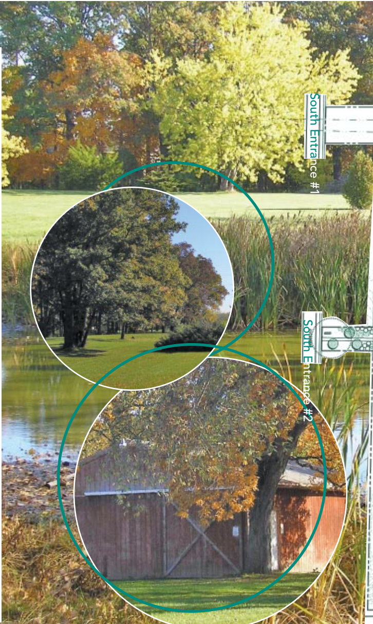
South Entrance #1